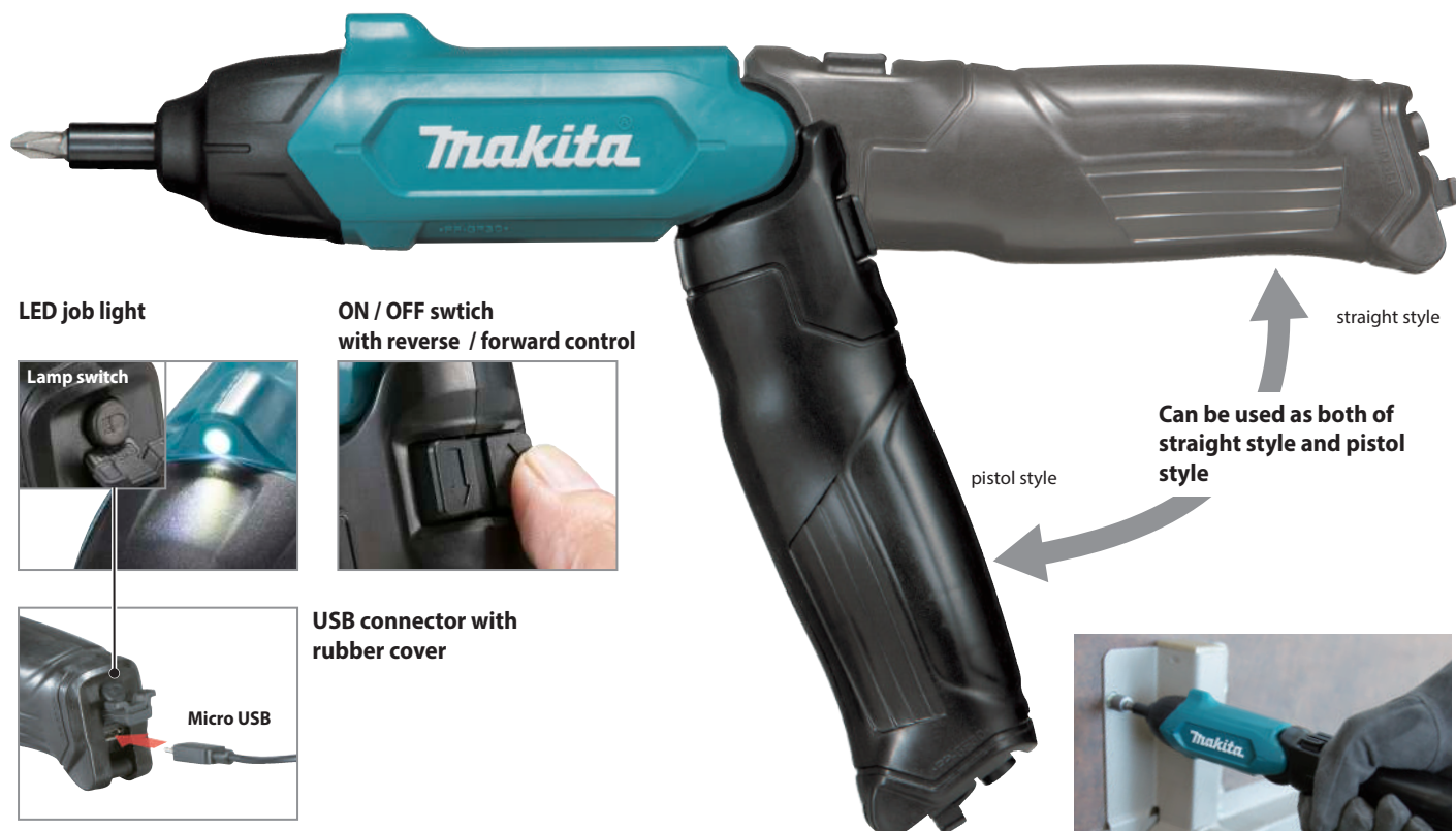
LED job light