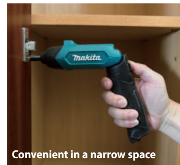
Convenient in a narrow space