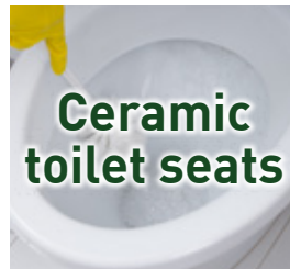
Ceramic toilet seats