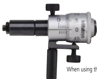
When using the extension rod